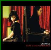
Ozzy and Kelly Osborne, Changes.