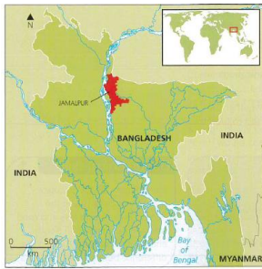
A Figure 23.22 The Jamalpur district in Bangladesh