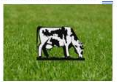
Friday 24 November 2023 7pm The Edge Arts Centre Farley Road, Much Wenlock, Shropshire, TF13 6NB

Three Acres And A Cow is a history of land rights and protest in folk song and story. The show connects the Norman Conquest and Peasants' Revolt with current issues like the housing crisis, reparations, climate breakdown and food sovereignty via the Enclosures, English Civil War and Industrial Revolution, drawing a compelling narrative through the radical people's history of England in folk song, stories and poems.