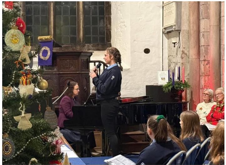
Lots of carols sung tonight as part of the Christmas Tree and Nativity Festival, lovely to see Much Wenlock Primary School Choir and William Brookes School choir taking part.

From church services to the dance and musical extravaganza, the WBS Oscars recognizing students for their exceptional ATL achievements, and, of course, some amazing Christmas jumpers!