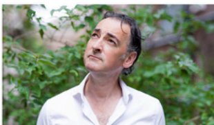
Alistair McGowan 3-in-1 Saturday 25 July 7.30pm £30