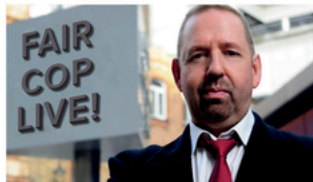
Alfie Moore Radio Warm Up Show Thursday 5 November 7.30pm £16