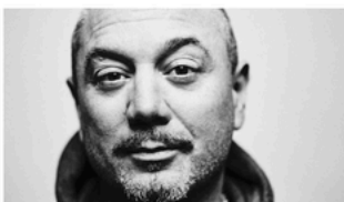
Huey Morgan Fun Lovin' Criminal Saturday 11 April 7.30pm £28