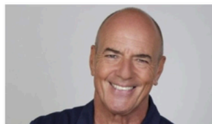
An Intimate Evening with Peter Cox of Go West Saturday 4 April 7.30pm £30