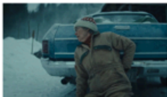
Monday Night Cinema Dead of Winter (15) Monday 22 June 7.30pm £6 (concessions £5)