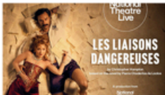
National Theatre Live Les Liaisons Dangereuses Thursday 25 June 7pm £12 (concessions £10)