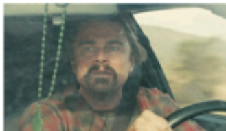
Thursday Night Cinema One Battle After Another (15) Thursday 2 July 7.30pm £6 (concessions £5)