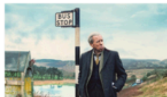
Monday Night Cinema The Last Bus (12) Monday 6 July 7.30pm £6 (concessions £5)