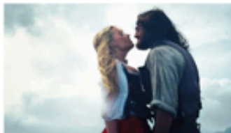
Monday Night Cinema Wuthering Heights (15) Monday 29 June 7.30pm £6 (concessions £5)