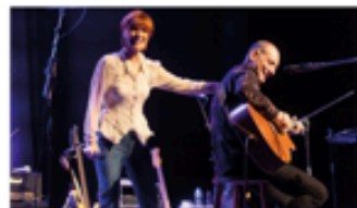
Kiki Dee & Carmelo Luggeri The Long Ride Home Tour Friday 26 June 7.30pm £23