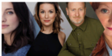
West End to Wenlock in aid of Severn Hospice Saturday 4 July 7.30pm £25